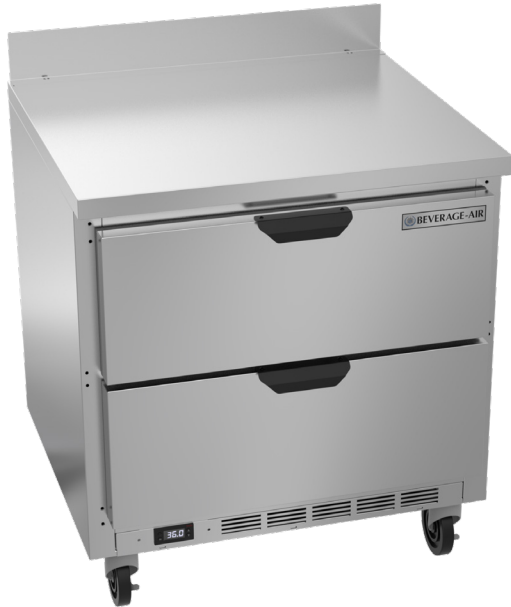
*Note: Shown with optional full electronic control

5 Year Parts/Labor Warranty Available 7 Year Compressor Warranty