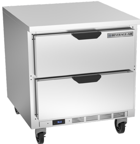
*Note: Shown with optional full electronic control

5 Year Parts/Labor Warranty Available 7 Year Compressor Warranty