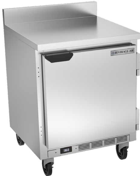
*Note: Shown with optional full electronic control

5 Year Parts/Labor Warranty Available 7 Year Compressor Warranty