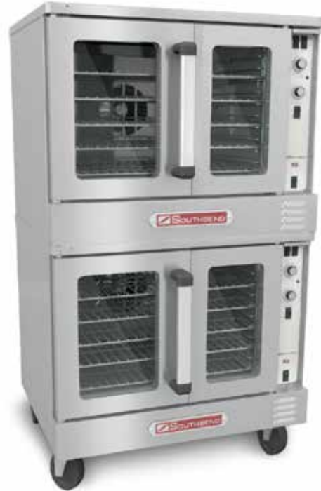
(SLGS/22SC shown with optional casters)