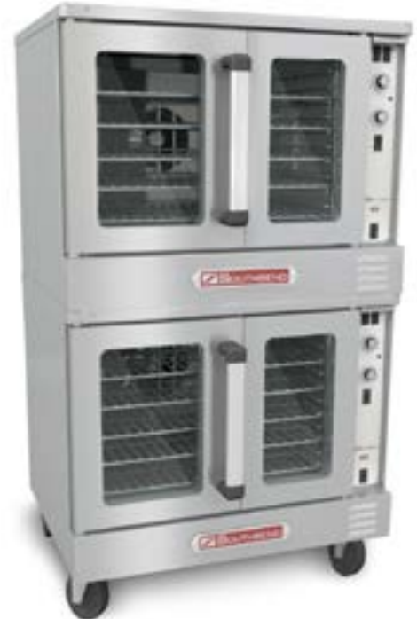
(SLES/20SC shown with optional casters)

SLES/20SC, SLES/20CCH SLEB/20SC, SLEB/20CCH