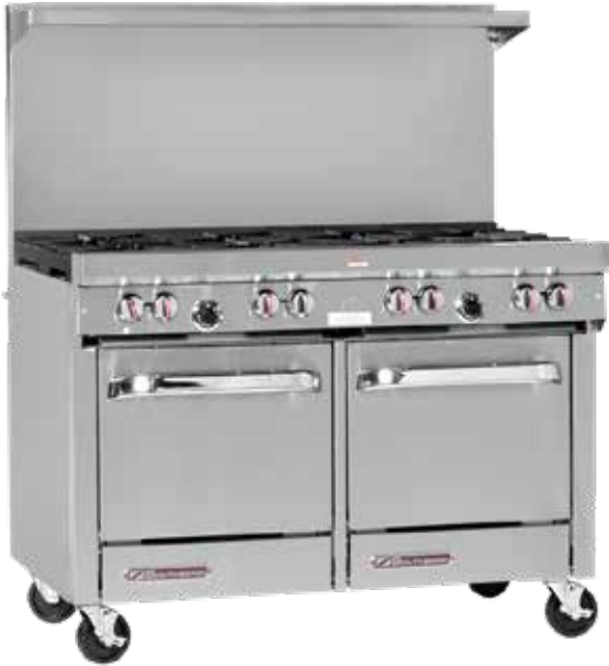
S48EE (shown with optional casters)