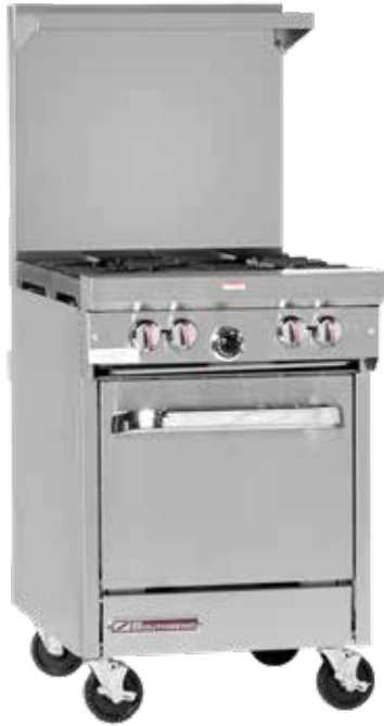
S24E (shown with optional casters)