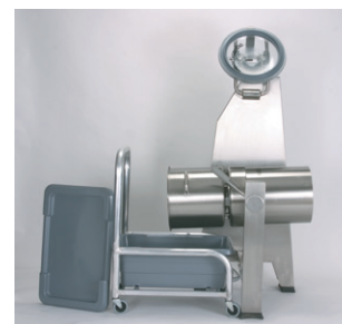
FOOD CART SHOWN WITH VCM