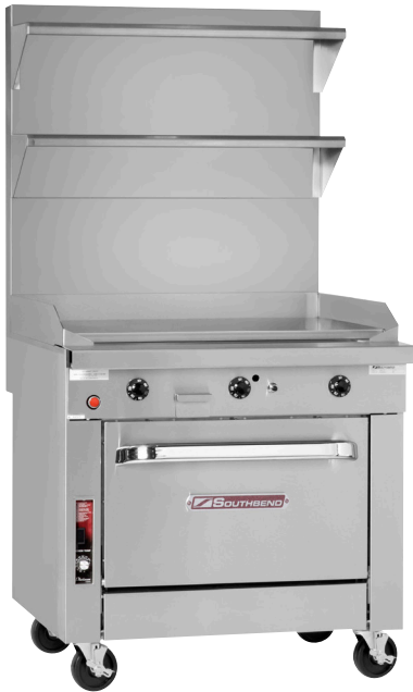
P36D-TTT w/ optional casters and flue riser.

** MANUAL GRIDDLES DO NOT ALLOW SPECIFIC TEMPERATURE OPERATION **