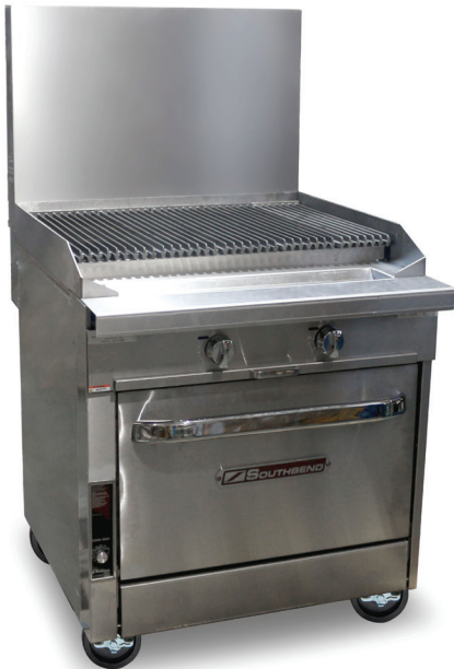
Model P32A-CC shown with optional 24" flue riser and optional casters