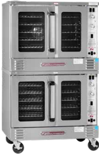
KLGS/27SC shown with optional casters