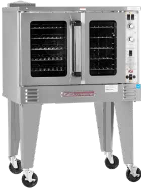
KLGS/17SC shown with optional casters