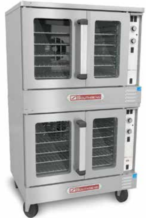
(KLES/20SC shown with optional casters)