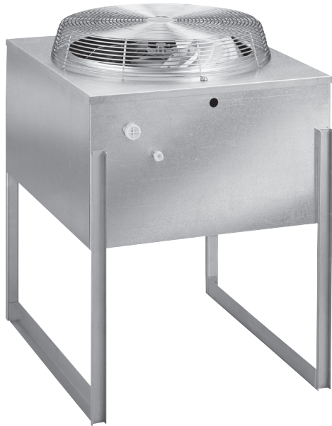
JCF900 Remote Condenser

Models JCF0500 JCF0500Q(Coated Coil) JCF0900 JCF0900Q(Coated Coil)