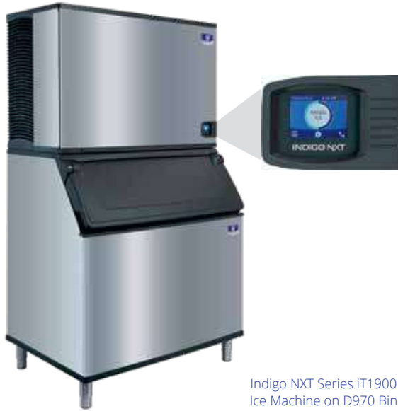
Indigo NXT Series iT1900 Ice Machine on D970 Bin

Designed for operators who know that ice is critical to their business, the Indigo NXT Series ice machine's preventative diagnostics continually monitor itself for reliable ice production. Improvements in cleanability and programmability make your ice machine easy to own and less expensive to operate.