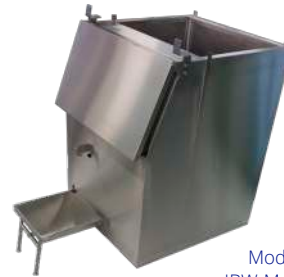
Model Shown IBW-M4 Marine Bin

Please contact the Manitowoc Ice sales department for details.