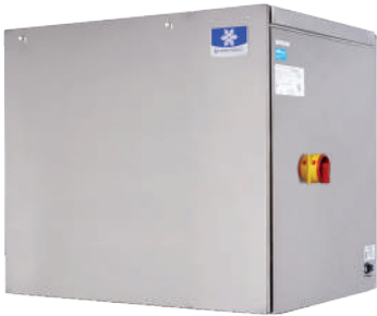
Model shown- IDT0750WM