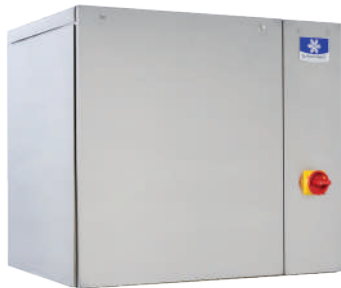
Model shown- IDT0900WM