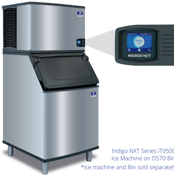
Indigo NXT Series iT0500 Ice Machine on D570 Bin *Ice machine and Bin sold separately

Designed for operators who know that ice is critical to their business, the Indigo NXT Series ice machine's preventative diagnostics continually monitor itself for reliable ice production. Improvements in cleanability and programmability make your ice machine easy to own and less expensive to operate.