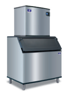
IDF1400C Ice Machine on a D-970 Bin