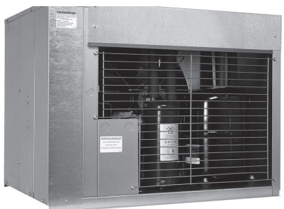
CVDF1400 Condensing Unit