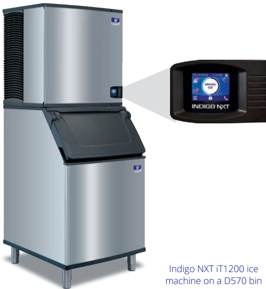
Indigo NXT iT1200 ice machine on a D570 bin

Designed for operators who know that ice is critical to their business, the Indigo NXT Series ice machine's preventative diagnostics continually monitor itself for reliable ice production. Improvements in cleanability and programmability make your ice machine easy to own and less expensive to operate.