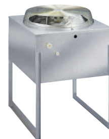
Standard air-cooled remote JCF0500-161

Remote Ambient Operating Temperature: -20 to 120F (-29C to 49C)