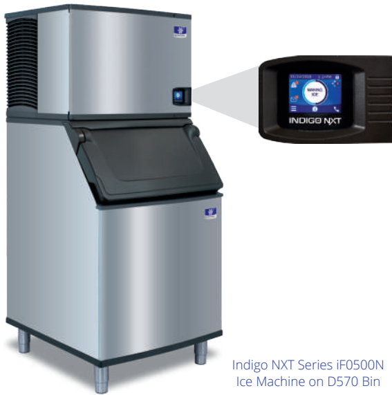
Indigo NXT Series iF0500N Ice Machine on D570 Bin

Designed for operators who know that ice is critical to their business, the Indigo NXT Series ice machine's preventative diagnostics continually monitor itself for reliable ice production. Improvements in cleanability and programmability make your ice machine easy to own and less expensive to operate.