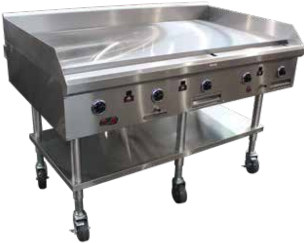
Model shown HDG-60-30 shown with optional stand and casters