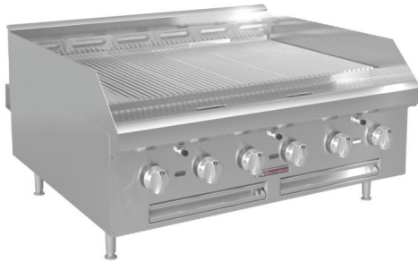
Model shown HDC-36-316L