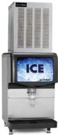
GEM 650 on IOD 200 DISPENSER

MODULAR GEM Series modular Pearl Ice machines feature the benefits of decreased water and power usage compared to cube ice makers. Additionally, the stainless steel exterior construction, industry-leading in-line direct drive technology and SystemSafe monitoring technology help reduce the number of costly breakdowns.