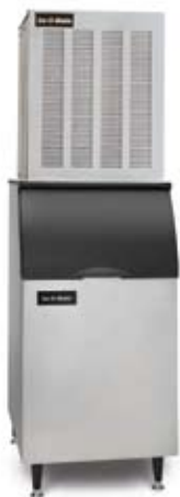
MFI 500 on B42 BIN

MODULAR MFI Series modular Flake ice machines feature the benefits of our SystemSafe load-monitoring control board that continually checks the workload on the gearbox. Additionally, the durable stainless steel evaporator, auger and in-line direct drive train will help reduce breakdowns.