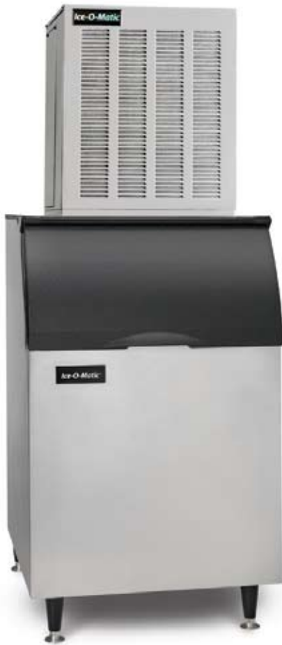
MFI 500 on B55 BIN

Available in a variety of ice-production capabilities, both the MFI Modular Flake and GEM Modular Pearl Ice machines share these state-of-the-art features: