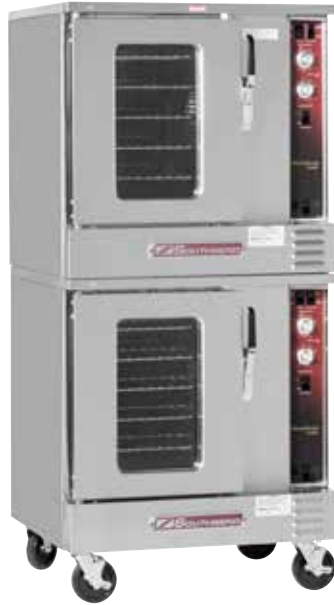
EH/20SC shown with optional casters