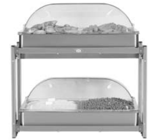
CMLB-24RT Multi-Level Buffet Server w/ Clear Rolltop Lids: 2 Level Shelves; 2 Steam Pan Holders; 4 Half Size Steam Pans w/Clear Lids 600 Watts / 5 amps / 120 Volts / 60 Hz