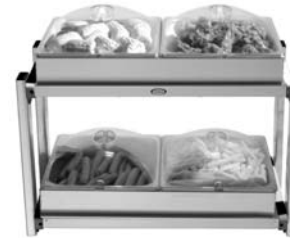
CMLB-24P Multi-Level Buffet Server w/Clear Lids: 2 Level Shelves; 2 Steam Pan Holders; 4 Half Size Steam Pans w/Clear Lids 600 Watts / 5 amps / 120 Volts / 60 Hz