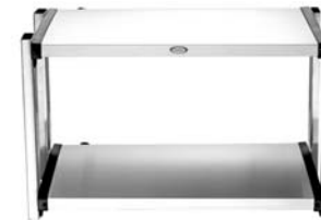
CMLW-2 Multi-Level Warmer: 2 Level Shelves 600 Watts / 5 amps / 120 Volts / 60 Hz