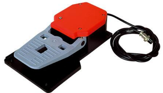
Optional Accessory: On / Off foot control pedal

** Due to continuous product improvement, specifications are subject to change without notice.