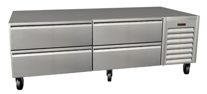
Model 30072SB with optional casters