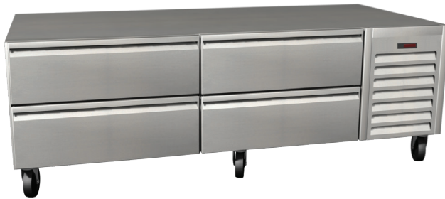
Model 20072SB with optional casters