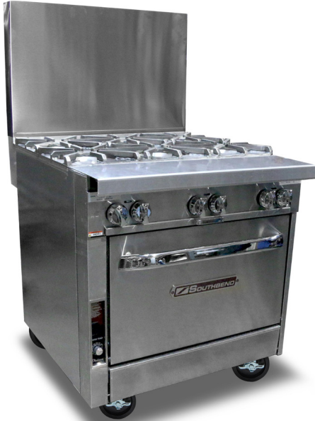
Model P32A-BBB shown with optional 24" flue riser and casters