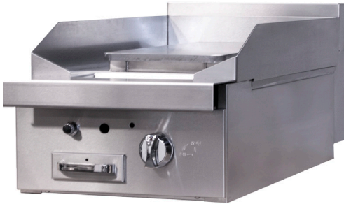
Model P16N-P shown

** PLANCHA UNITS DO NOT ALLOW SPECIFIC TEMPERATURE OPERATION **